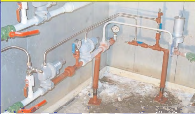
Mini VPR installation by Teresen Gas at Honeymoon Creek BC, Canada. Inlet pressure 750 PSI, outlet pressure 60 PSI, flow rate 300 SCFH to 1900 SCFH

The VPR technology can be efficiently applied for Farm Tap installations as well as for building relatively small Pressure Regulation Stations (e.g. district and border ones). In addition to the benefits stated above, there is one more advantage for the VPR -equipped stations: